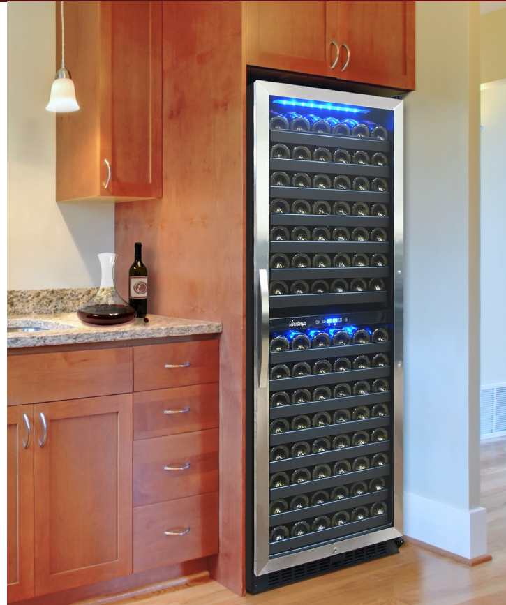
Centrally located control panel

For sleek, stylish and sophisticated wine storage for your prized collection, the 155-Bottle Dual Zone Wine Cooler by Vinotemp is the perfect solution. This dual zone wine cooler allows you to set two separate temperatures to provide optimum conditions for up to 155 bottles of both your reds and whites. A conveniently located digital control panel makes setting the ideal temperatures a simple task. Contemporary styling includes a black body and a dual-pane glass door. Vinotemp's patented Ouzo™ wine racks with black lip cradles your collection behind a glass door with stainless steel trim. Thirteen sliding shelves and 2 half shelves provide easy access to your storage space, where 77 standard 750ml bottles fit in the upper zone and 78 in the lower. A front-exhaust allows this cooler to be placed as a built-in or freestanding unit.