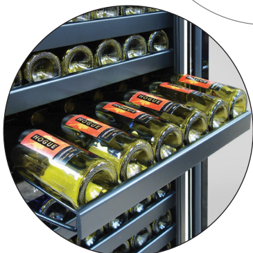
Patented wine racks with black lip