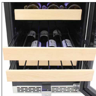
Empty Shelves Out