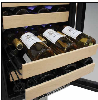
Shelves with Wooden Lip