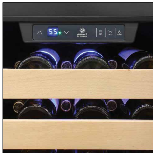
Control Panel and Shelves