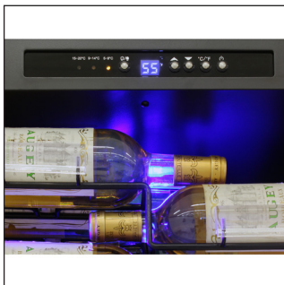
Control Panel & Interior