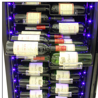
Racking with Bottles