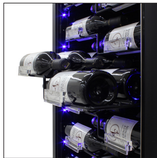
Racking with Bottles