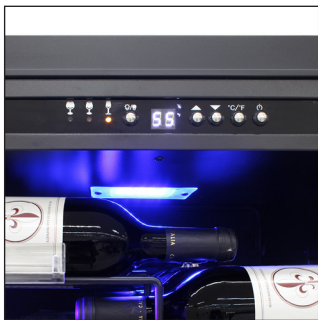
Control Panel & Interior

Store your wine collection in this elegant Vinotemp EL-168ZZ-S Single-Zone Wine Cooler. Featuring seamless stainless steel glass door and all-glass technology, this cooler has room to store up to 157 bottles on twelve full size Prism™ Zig Zag Racks with acrylic patent pending strips and 1 bulk storage section. A digital temperature control panel located at the top of the cooler allows you to see and set the temperature for your wines. The interior Vinotemp BioBlu™ LED lighting (which helps reduce the growth of bacteria and mold) and the design of Luminescent Racks create a gorgeous pattern display and make it easy to find your favorite bottles. A black cabinet with dual-pane glass door and door lock add to the style and functionality of this cooler. This wine cooler will make your medium to large sized wine collection stand out.