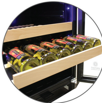
Wine Racking and Bulk Storage