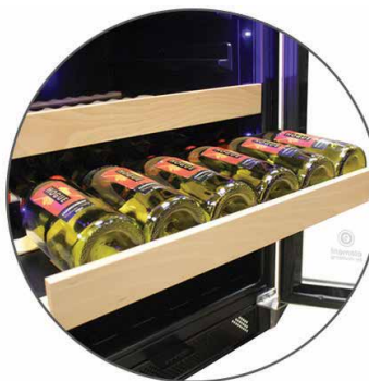
Wine Racking and Bulk Storage