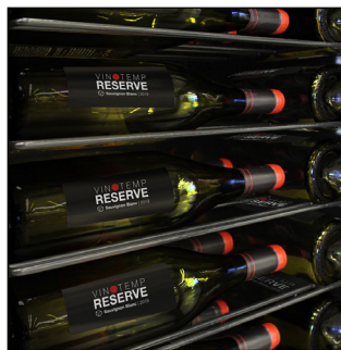
Bottles and Shelves