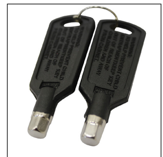
Key and Lock