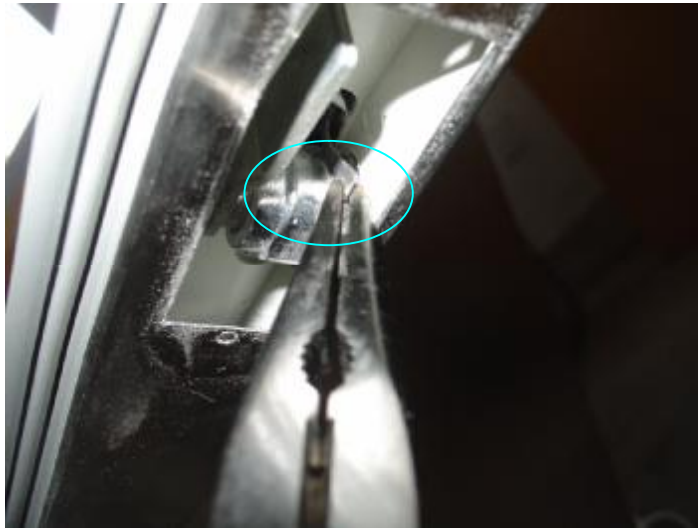
4. 将锁取出 Pull out the lock.