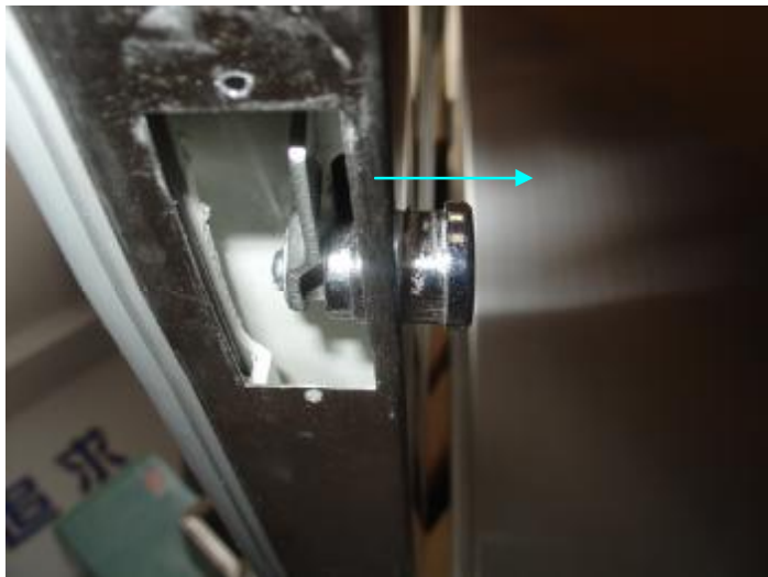
5. 更换一具新锁 Replace with a new lock.