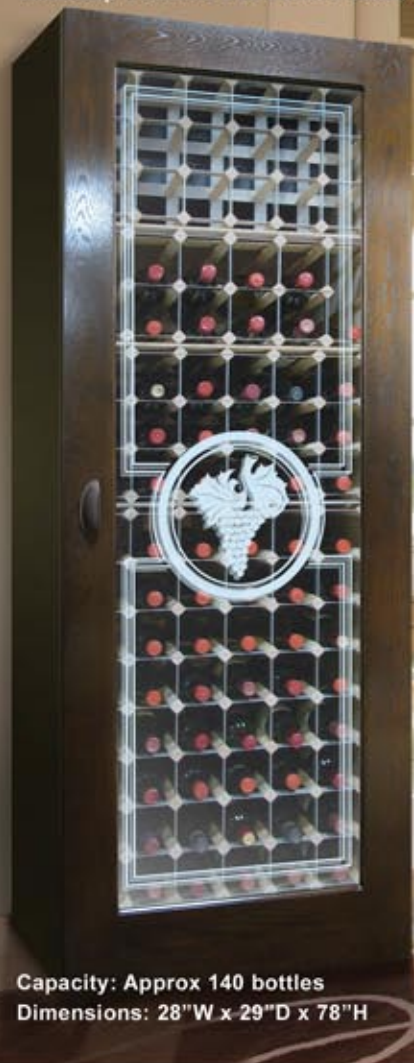
Capacity: Approx 140 bottles Dimensions: 28"W x 29"D x 78"H