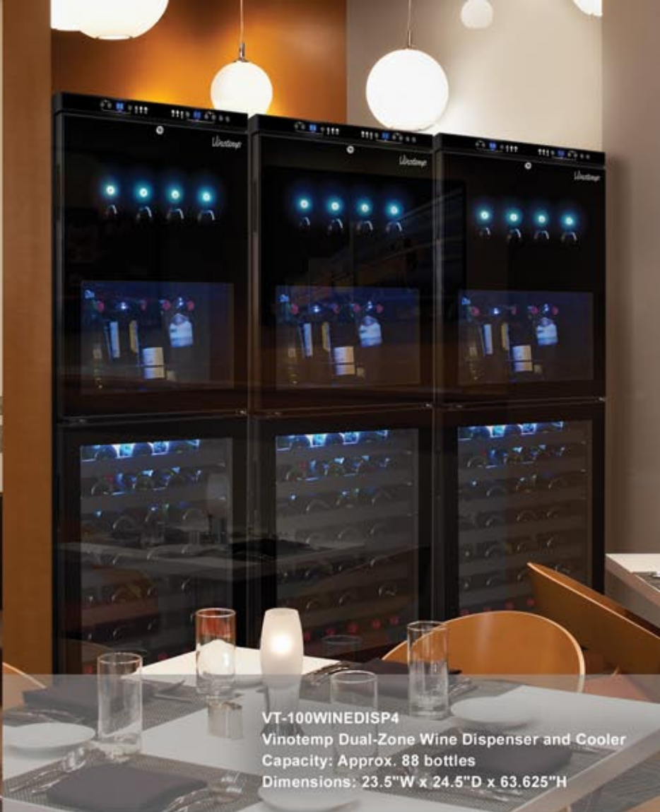
VT-100WINEDISP4 Vinotemp Dual-Zone Wine Dispenser and Cooler Capacity: Approx. 88 bottles Dimensions: 23.5"W x 24.5"D x 63.625"H