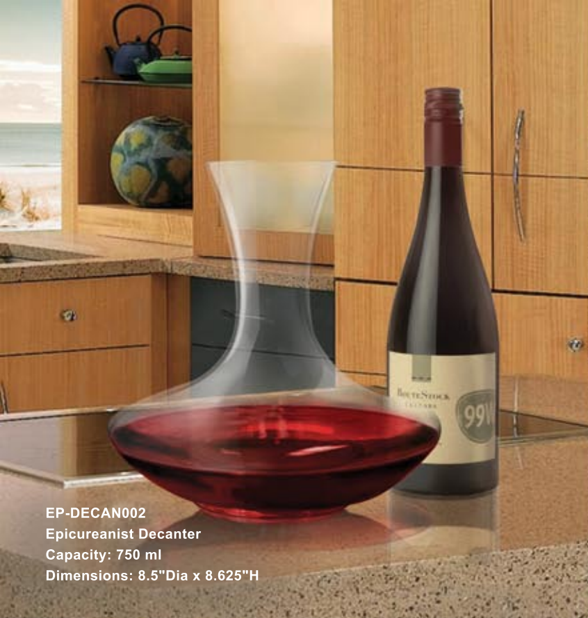
EP-DECAN002 Epicureanist Decanter Capacity: 750 ml Dimensions: 8.5"Dia x 8.625"H