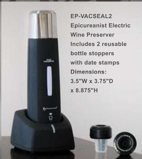
EP-VACSEAL2 Epicureanist Electric Wine Preserver Includes 2 reusable bottle stoppers with date stamps Dimensions: 3.5"W x 3.75"D x 8.875"H