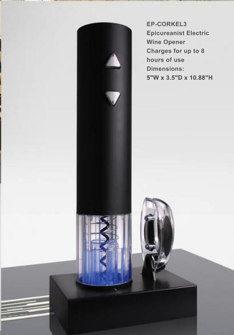
EP-CORKEL3 Epicureanist Electric Wine Opener Charges for up to 8 hours of use Dimensions: 5"W x 3.5"D x 10.88"H