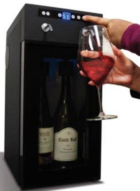
VT-WINEDISP2 Vinotemp 2 Bottle Wine Dispenser (4 Bottle Wine Dispenser also available) Capacity: 2 bottles Dimensions: 9.5"W x 16.50"D x 20.75"H