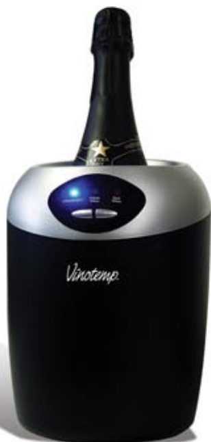
VT-CHILLER CHA Vinotemp Champagne Chiller Capacity: 1 wine or champagne bottle (standard sizes) Dimensions: 6.69"(dia.) x 10.83"H