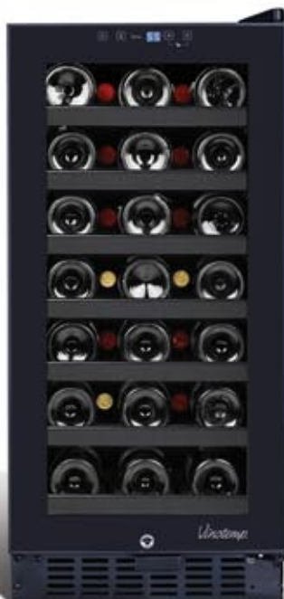
VT-34TS-FE Vinotemp 33-Bottle Touch Screen Wine Cooler Capacity: Approx. 33 bottles Dimensions: 14.8"W x 22.4"D x 33.1"H